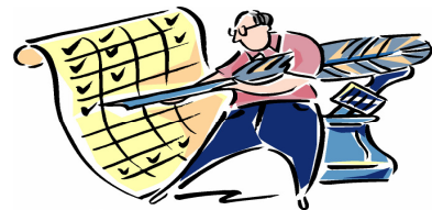
Attendance and Offering Report