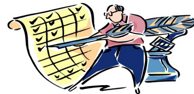
Attendance and Offering Report