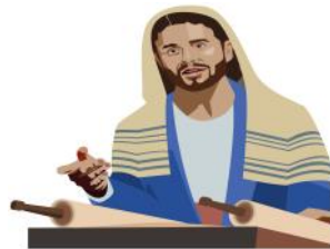
Jesus Teaches at the Synagogue in Nazareth

He went to Nazareth, where he had been brought up, and on the Sabbath day he went into the synagogue, as was his custom.